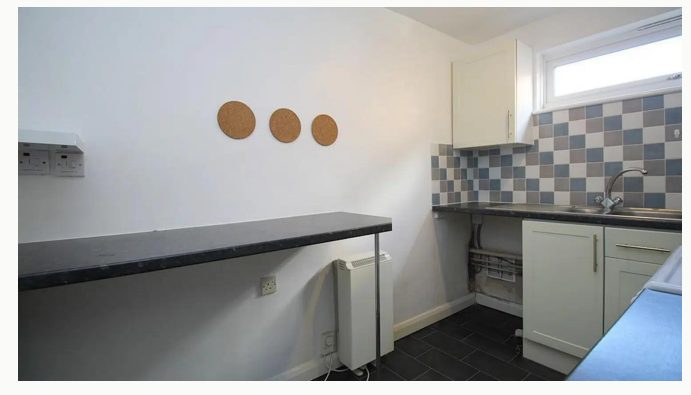
Kitchen and breakfast bar