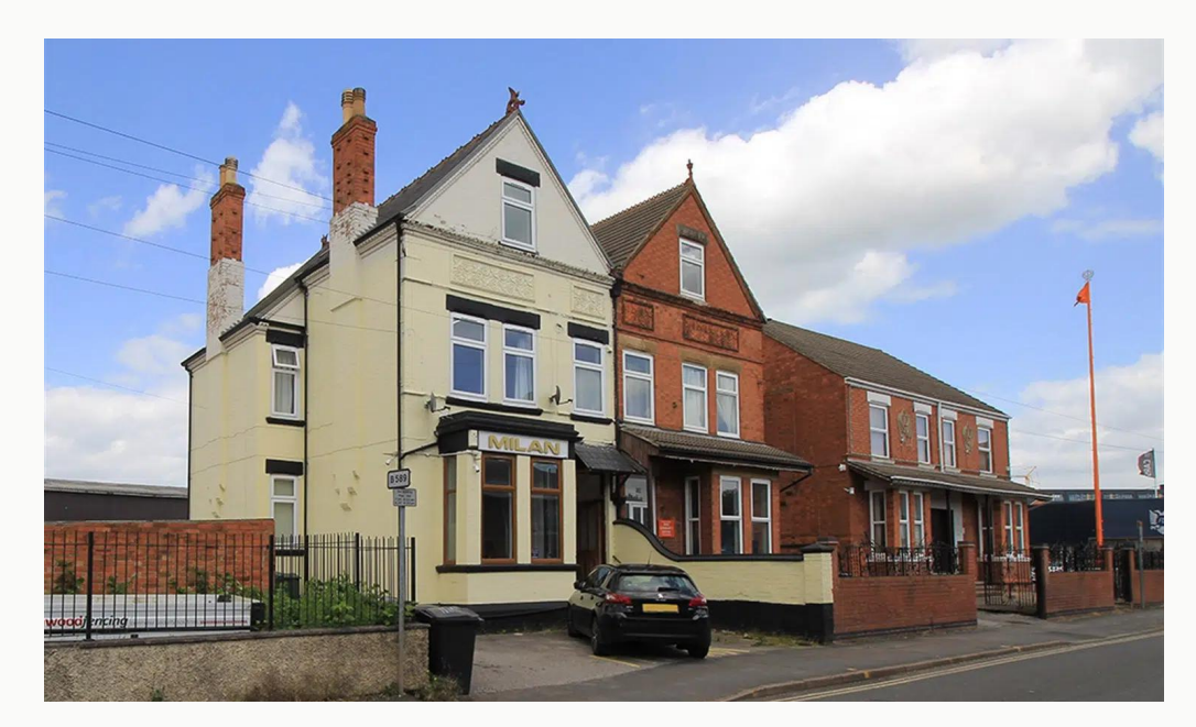
Clarence Street Ba