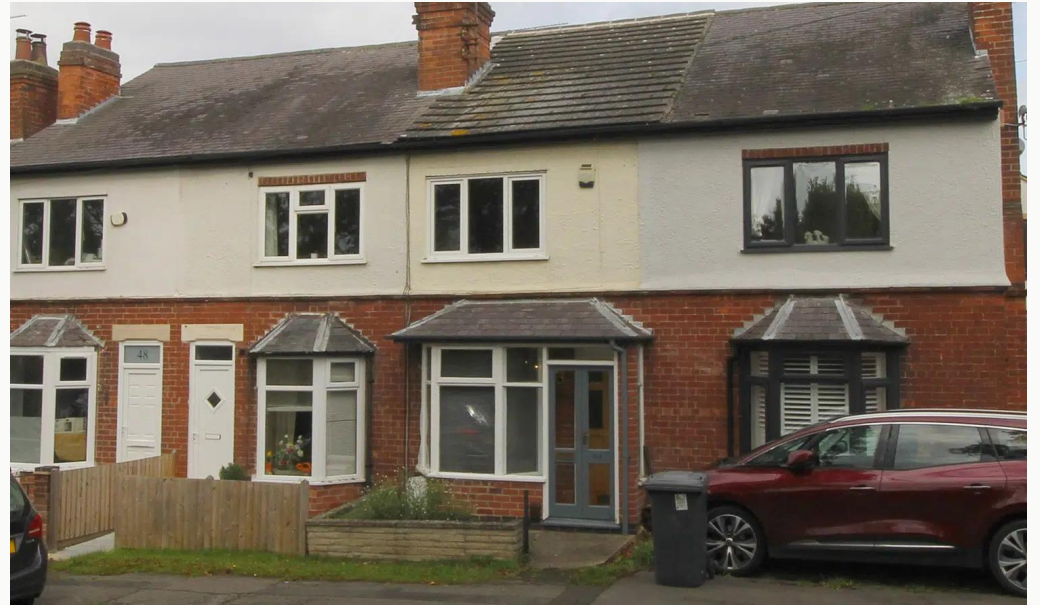
West Leake Road