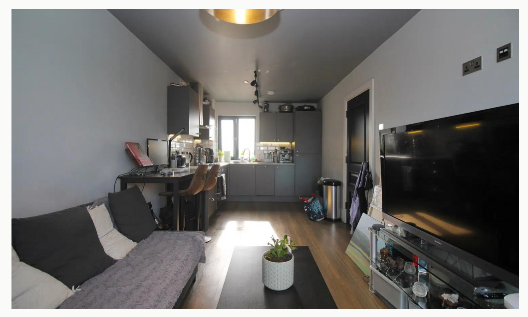
Lounge / Kitchen